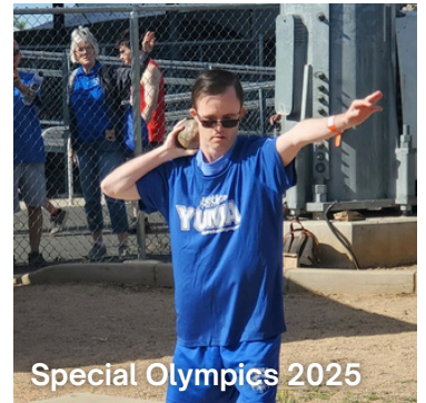
Special Olympics 2025