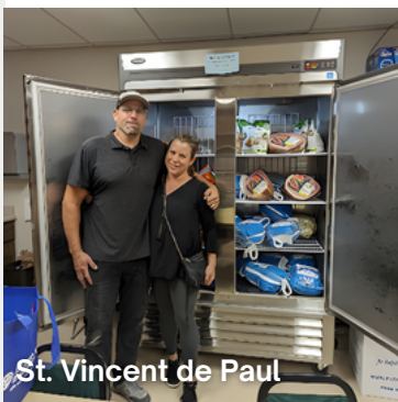
St. Vincent de Paul