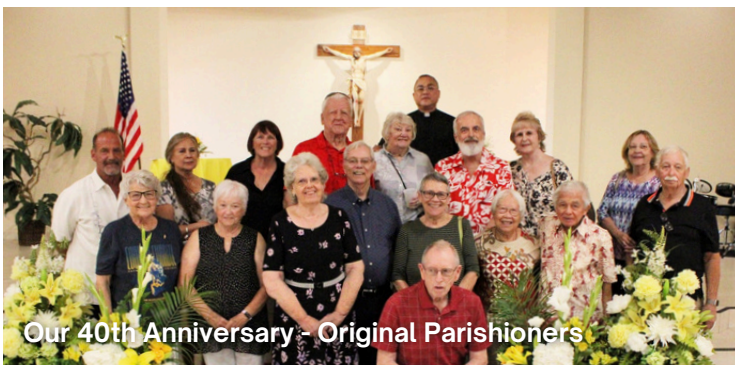
Our 40th Anniversary - Original Parishioners