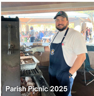
Parish Picnic 2025