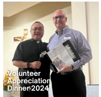
Volunteer Appreciation Dinner 2024