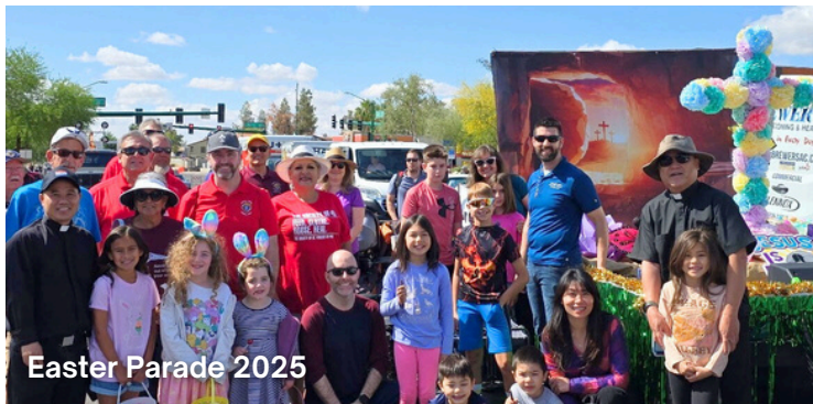
Easter Parade 2025

"Do not neglect to do good and to share what you have, for such sacrifices are pleasing to God." Heb. 13:16