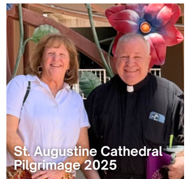
St. Augustine Cathedral Pilgrimage 2025